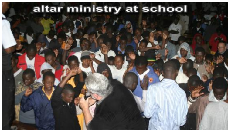
altar ministry at school