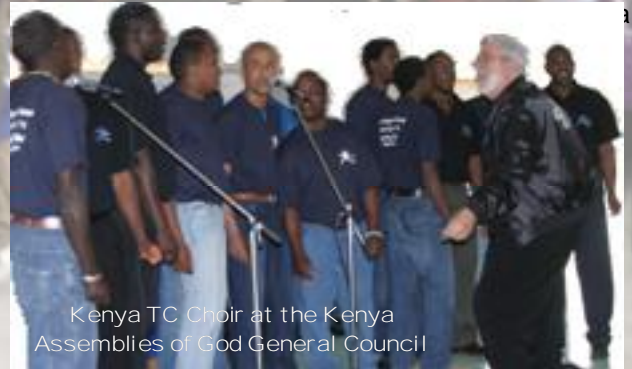
Kenya TC Choir at the Kenya Assemblies of God General Council