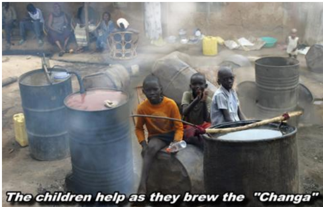
The children help as they brew the "Changa"

The little girl on the right is a courier who walks the sewers, delivering the illegal "white lightning" to the men. The fields are truly "white" for the harvest. Please pray for the children. We are so grateful that you have sent us and stood with us in prayer for the hundreds that came to Christ.