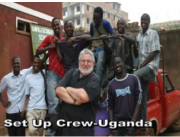
Set Up Crew-Uganda

KAMPALA, UGANDA NEWS: "God is Good!" The Lord moved powerfully in Uganda touching lives. We saw hundreds crowd into packed altars in the schools, church, and on the street asking Christ in their hearts. Some prayed to be set free from drugs as God confirmed his promise of freedom. Many