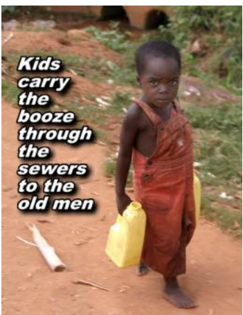
Kids carry the booze through the sewers to the old men

The little girl on the right is a courier who walks the sewers, delivering the illegal "white lightning" to the men. The fields are truly "white" for the harvest. Please pray for the children. We are so grateful that you have sent us and stood with us in prayer for the hundreds that came to Christ.